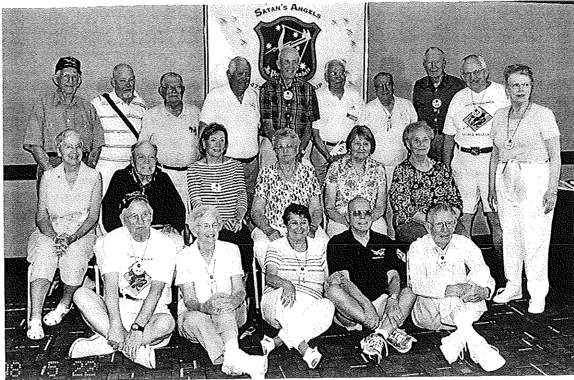
THE ENTIRE 475 TH GANG